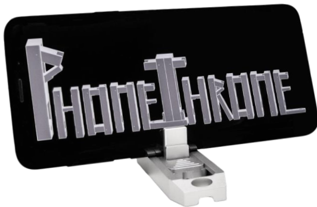
PhoneThrone - Keychain Smartphone Stand

Congratulations on receiving your new PhoneThrone stand by VoteMatrix™